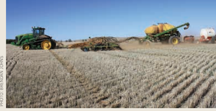
Improved stubble management is a key benefit of inter-row sowing

We also had problems losing data, particularly AB lines from one year to next and have had problems with on-board computers crashing.