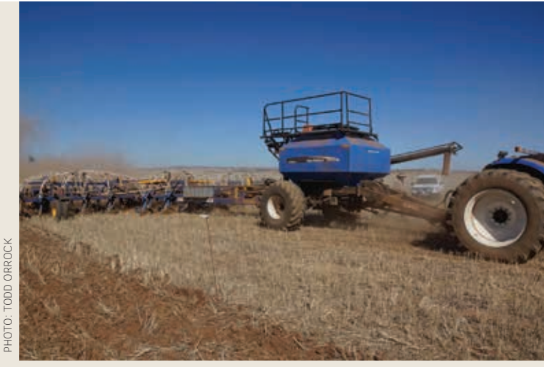
The ability of the seeder bar to track straight is the biggest challenge for inter-row sowing