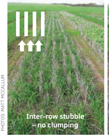
FIGURE 2. Plant establishment for inter-row (left) and in-row (right) treatments at Sandilands SA 2005