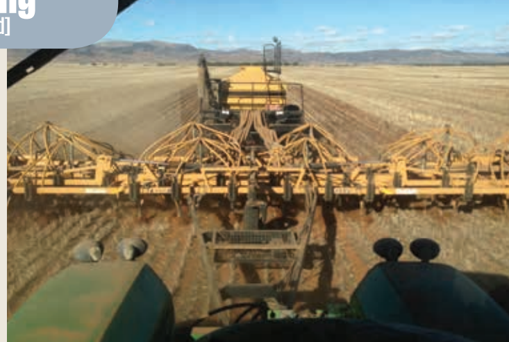
Successful inter-row sowing near Baroota

We use a 14.5m Versatile Ezee-on bar with 25cm row spacings with a tow-behind box. The bar has dual fixed wheels at the rear of the machine with swivel wheels at the front. The GPS is mounted on the tractor and provides good tracking of the bar.