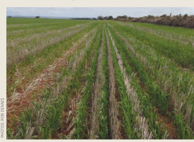
Standing stubble helps reduce the risk of wind erosion on lighter soils