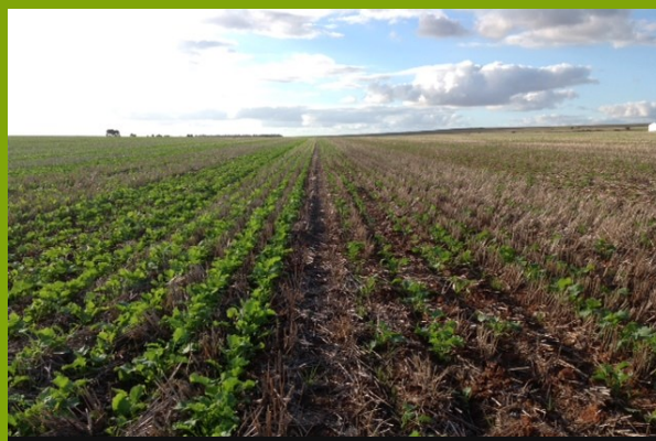
Canola Seeding Demonstration - Showing results already.