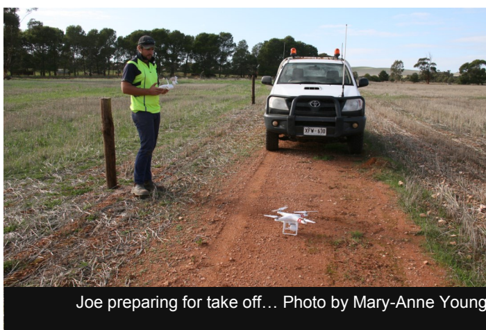
Joe preparing for take off...

One of the things we are keen to look at is a "birds-eye" view of the paddocks to see if we can pick up stock tracks and uneven cover so Joe Koch has done a flyover with a drone to get some aerial photos. It will be interesting to see if this can be a valid method of assessing surface cover in paddocks.