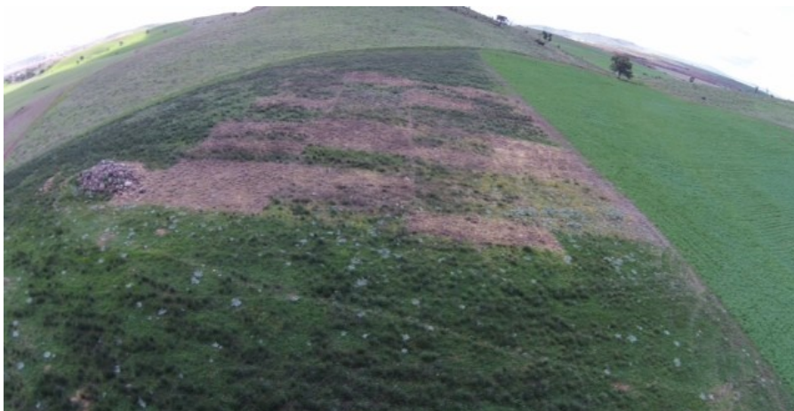
Replicated plot trial of Onion Weed Chemical Control Options.

The 2014 Onion Weed Control Trial has had both applications now applied and the first counts undertaken to rate the 18 different chemical treatments.